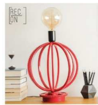
ARTE MODERNO RECICLADO Cimo las residuo o ecamiente este moderna y estifica. La expessición presente los difestes divicio y estadopum no les estada REC.ON 21 de Octobers de 2022 a los 20.00